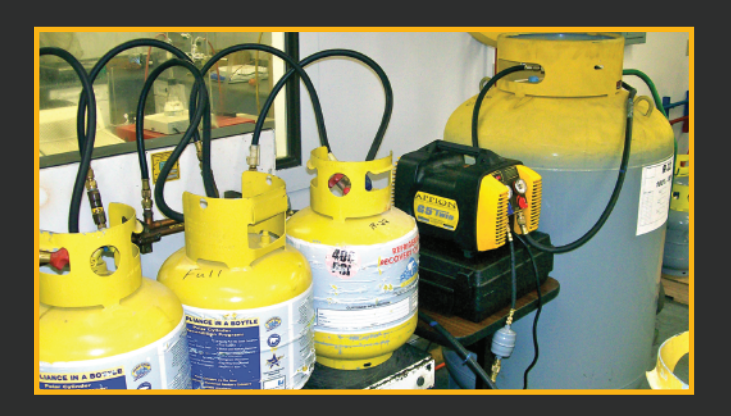
G5Twin used daily in a reclamation facility for tank to tank transfers.

On a R-407A system retrofit of a low temperature ice cream case, the G5Twin recovered 600 lbs of R-22 in record time using the Push-Pull Method.